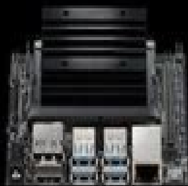
Jetson Nano Developer Kit