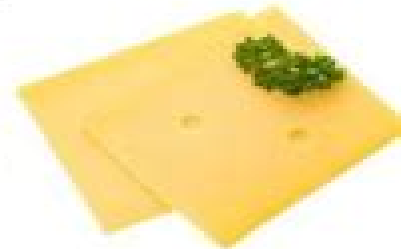
Cheese Slice 1 count