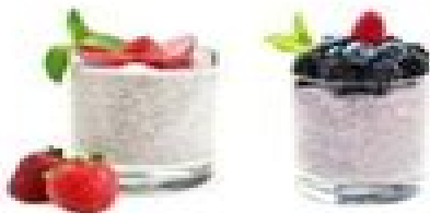
Chia Seeds Pudding