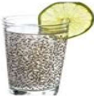
Chia Seeds Water