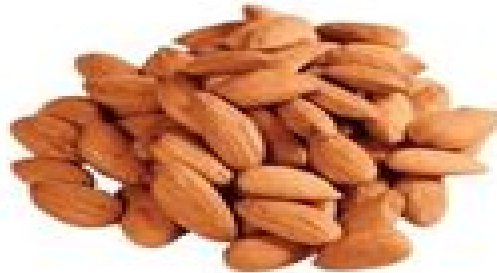
Almonds 10 count