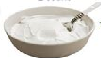
Greek Yogurt 1 cup