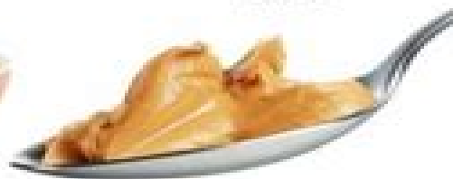
peanut butter 1 tbsp