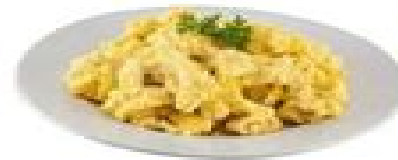
Scrambled Eggs 2 count