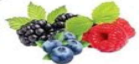
Berries 1/2 cup