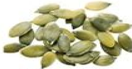
Pumpkin Seeds 1 TSP