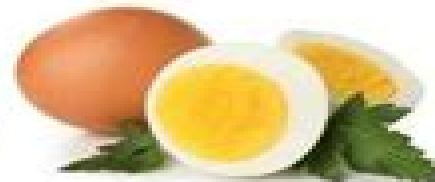
Boiled Eggs 2 count