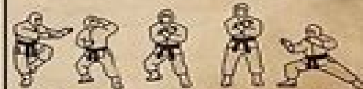
HICHO KOSEI JUMONJI HENKA JUMONJI KIHON IHEN HAGI