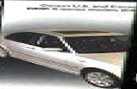
The 2004 BMW 3-500