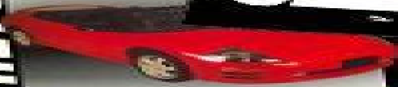
The 2004 Chevrolet Monte Carlo