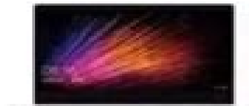
For HP Notebook