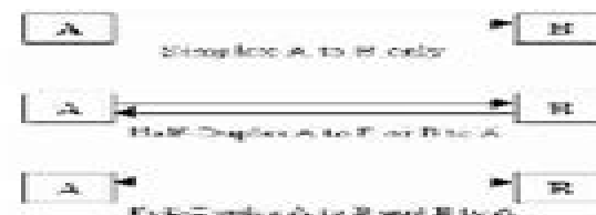
Fig. 3 different types of serdes cores

SerDes cores which contain only transmit or only receive channels are called simplex cores; SerDes cores which contain both transmit and receive channels are called full duplex cores. Note that the terminology "full duplex" does not imply that the electrical interface is bidirectional. Any given electrical interconnect channel has a fixed direction of data transmission. If a protocol application requires "full duplex" communication, then independent transmit and receive channels with independent interconnections are used to implement the interface.