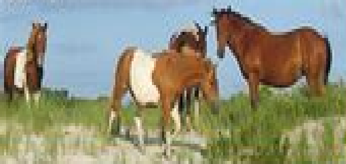
Pony Penning (Following Year)

Dignity - worthy of honor or respect, serious manner or style Borne - carried or held up Abandon - totally free (the Phantom moving through space in wild abandon) Frenzy - uncontrolled or wild excitement