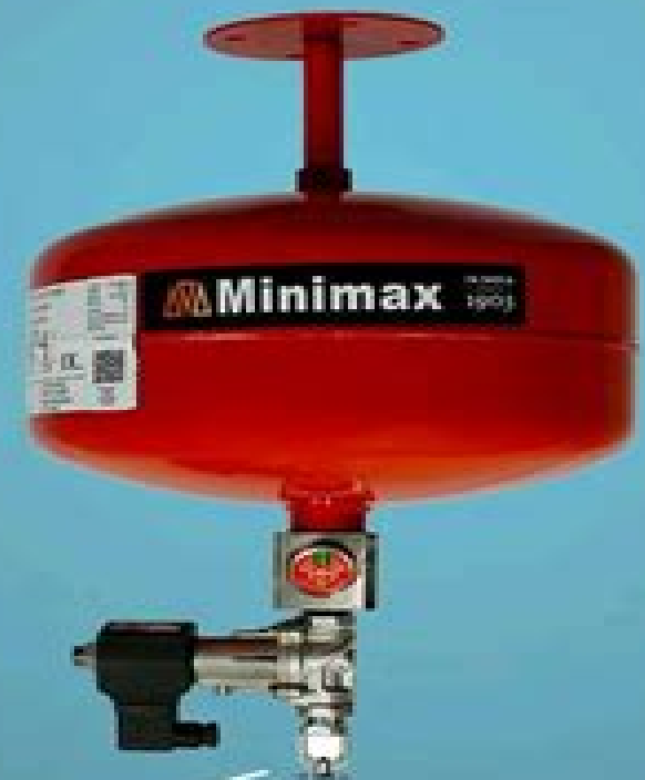
FIRESPOT® Room Protection System