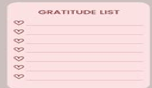
5 minute journal