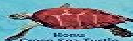
Honu Green Sea Turtle

Area: 597 sq. mi. (1557 sq. km) Coastline: 112 mi. (180 km) Size: 60 mi. (97 km) wide x 30 mi. (48 km) high Population: 900,000 + (400,000 in Honolulu) High Spot: Kaala, 4020 ft (1225 m) Rainfall: Honolulu Coastal - 22 in. (56 cm/yr) Kailua - 75 in. (193 cm/yr) Mountains - 80 to 200+ in. (508+ cm/yr)