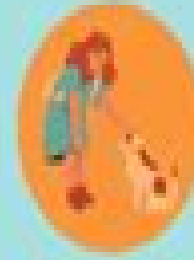
Spending Time With Pet & Animals