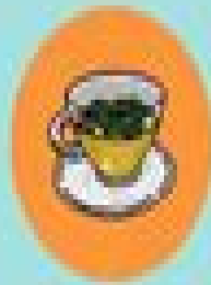
Drinking Herbal Tea