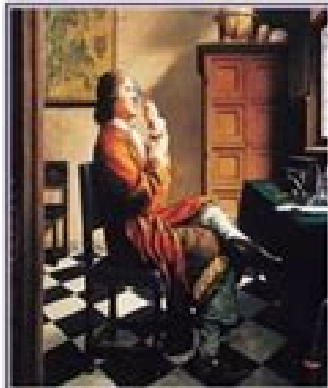
(a) Van Leeuwenhoek using his microscope