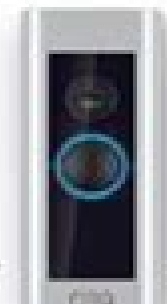
Video Doorbell Pro