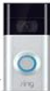
Video Doorbell 3 Plus