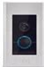
Video Doorbell Elite