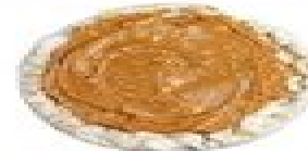
Rice Cakes w/ Honey & Almond Butter