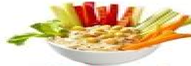
Hummus & Veggies