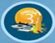
Omega 3 Fatty Acids