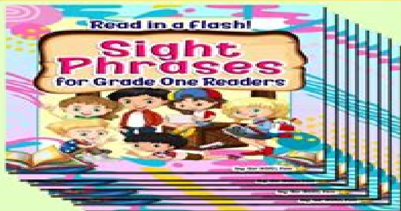
SIGHT PHRASES COMPLETE GRADES 1-6 36 CHARTS