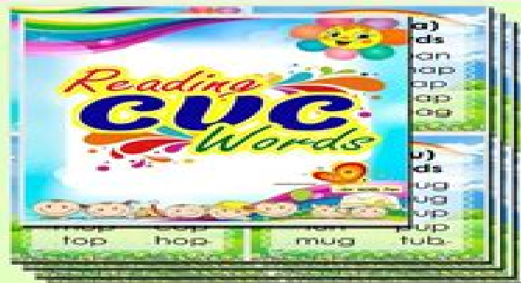
CVC WORD 26 CHARTS