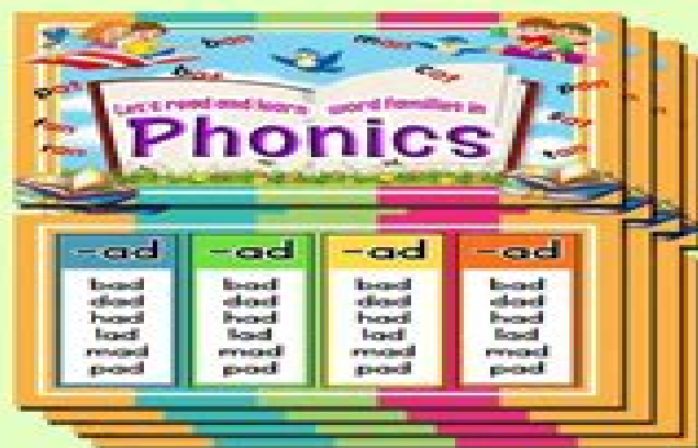
PHONICS 20 CHARTS