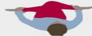
RECLINING COW FACE