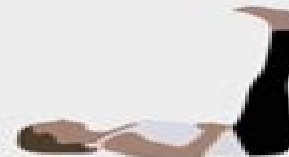
LEGS UP THE WALL