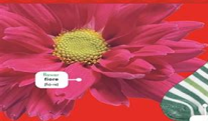
flower fior (fay-er)