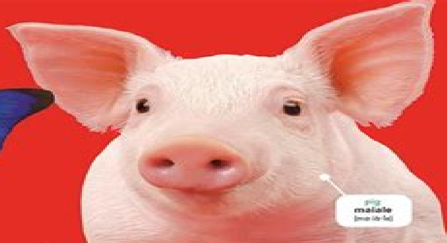
pig maiale (may-ah-lay)