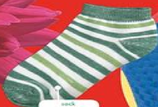
sock calzino (call-ah-ee-no)