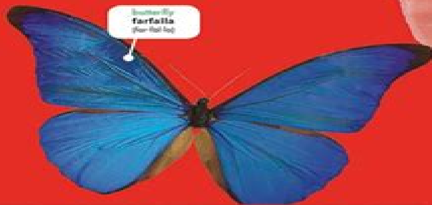
butterfly farfalla (far-fall-ah)