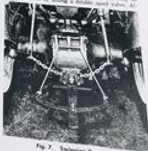
Fig. 7. Estimating Discharge

The types of thrusts found to be most economical are the "V" extension thrusts, the swinging thrusts and the universal thrusts, as there are still other proven nonswinging in the field. It is recommended, however, that when the thrust is equipped with a single speed reduced hydraulic control valve, that the "V" extension thrusts be used, as Fig. 3. In this case if a swinging or universal thrust were used, difficulty would be encountered in providing the lower legs from moving much less than the hydraulic lift was operated. If it is not practical to connect the lower legs by means of the stay links which are thrust with the "V" thrusts, this problem may be easily solved by fitting a double speed valve.