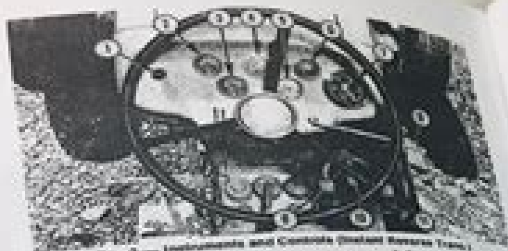
Fig. 2—Instruments and Controls (Instant Reverse Trans.)