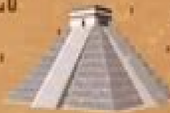
CHICHEN ITZA YUCATÁN