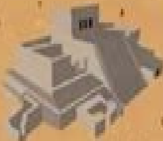
TULUM QUINTANA ROO