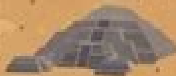
TEOTIHUACAN EDO DE MÉXICO