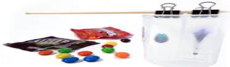
Is it Ripe? Circuit