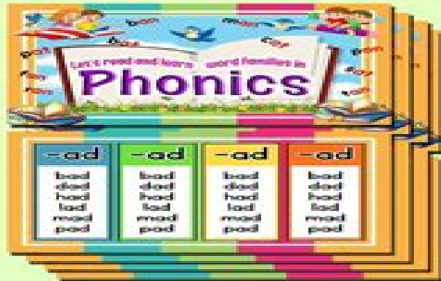
PHONICS 20 CHARTS