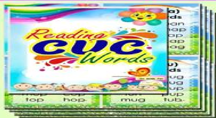
CVC WORD 26 CHARTS