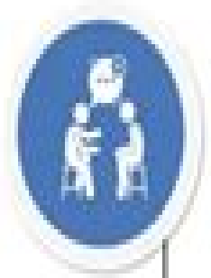
The Nibble Technique