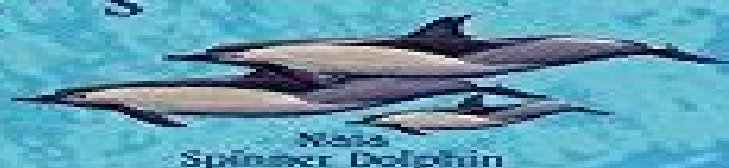
Kaia Spinner Dolphin