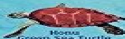
Honu Green Sea Turtle

Area: 597 sq. mi. (1557 sq. km) Coastline: 112 mi. (180 km) Size: 60 mi. (97 km) wide x 30 mi. (48 km) high Population: 900,000 + (400,000 in Honolulu) High Spot: Kaala, 4020 ft (1225 m) Rainfall: Honolulu Coastal - 22 in. (56 cm/yr) Kailua - 75 in. (193 cm/yr) Mountains - 80 to 200+ in. (508+ cm/yr)