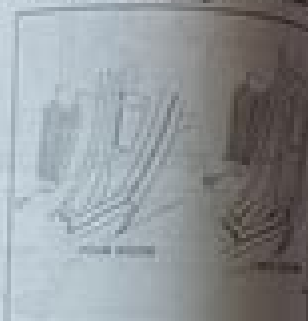
Fig. 18. Hood latch release cable assembly