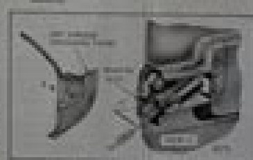
Fig. 20. Hood latch release cable assembly

To install, remove the hood latch release cable from the hood latch assembly. The cable is attached to the hood latch and the engine compartment latch. The cable is used to operate the hood latch.