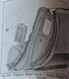
Fig. 16. Hood latch release cable assembly