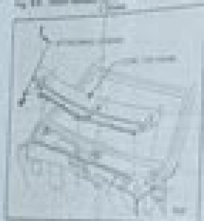
Fig. 17. Hood latch release cable assembly