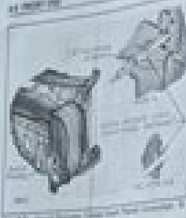
Fig. 15. Hood latch release cable assembly