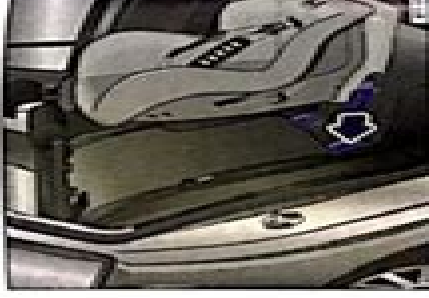
Fig. 28 Fixing a typical ISOFIX child seat with the attachment arms.

CD Please refer to A and D at the start of the chapter on page 28.