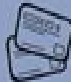
Federal student loans