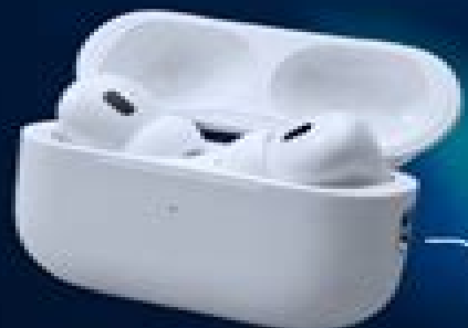
Pro 2nd Gen