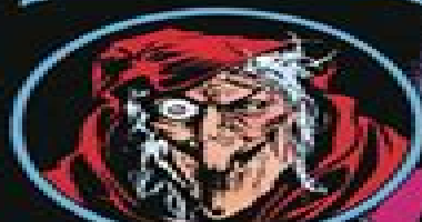
THE OLD WITCH