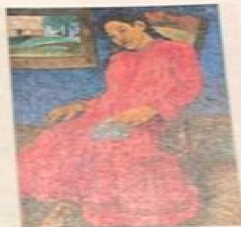
Faaturuma (Melancholy), 1891