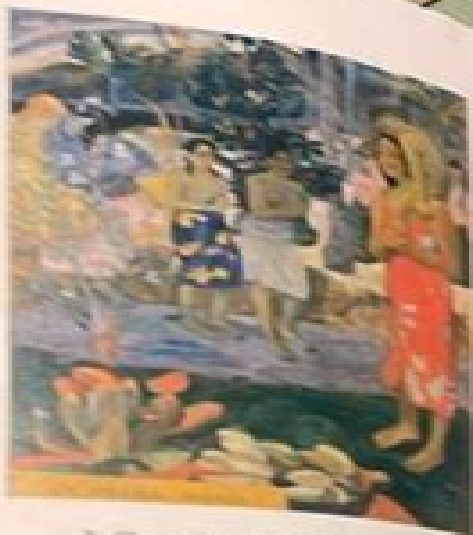
La Corona Maria (Hail Mary), 1891