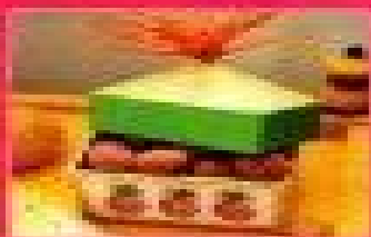
Café sur l'échiquier

Voilà, maintenant magazine de cartonnages brodés !