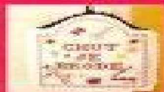
Des réalisations originales et créatives