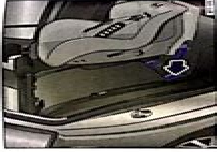
Fig. 28 Fixing a typical ISOFIX child seat with the attachment arms.

CD Please refer to A and D at the start of the chapter on page 28.