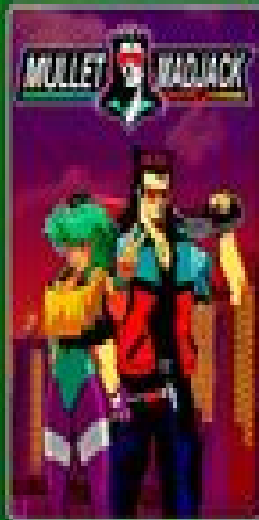
ULTIMATE, PC Also Available On: PS5, Xbox Series X|S