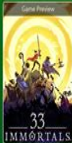
ULTIMATE, PC Also Available On: PS5, Xbox Series X|S