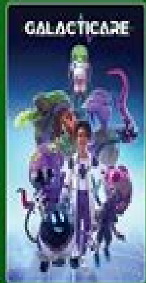
STANDARD Also Available On: PS5, Xbox Series X|S