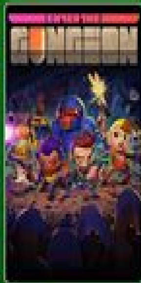
ULTIMATE, PC, STANDARD Also Available On: PS5, Xbox Series X|S