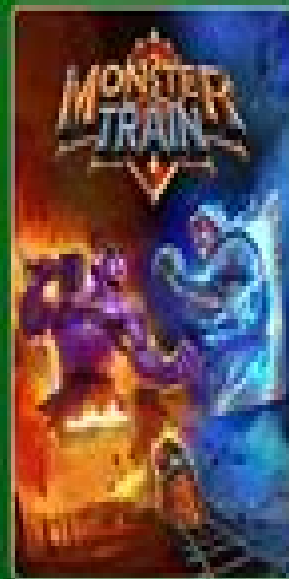
ULTIMATE, PC, STANDARD Also Available On: PS5, Xbox Series X|S