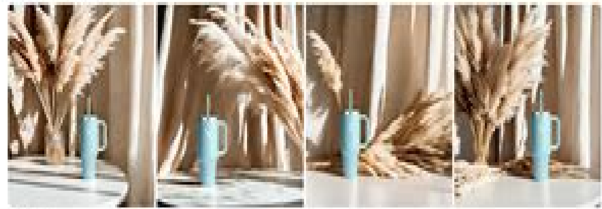
Theme: Rustic Use setting again