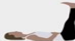
LEGS UP THE WALL