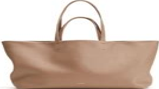
1. CUYANA EASY TOTE