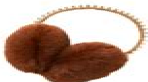
11. CRYSTAL EARMUFFS