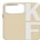
15. LEATHER PHONE CASE