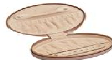
8. TRAVEL JEWELRY CASE