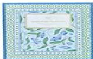
9. 2023 MONTHLY PLANNER