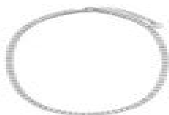
2. DIAMOND TENNIS NECKLACE