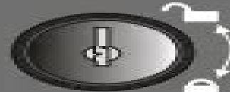
Dual Action NBG-12LR shown activated