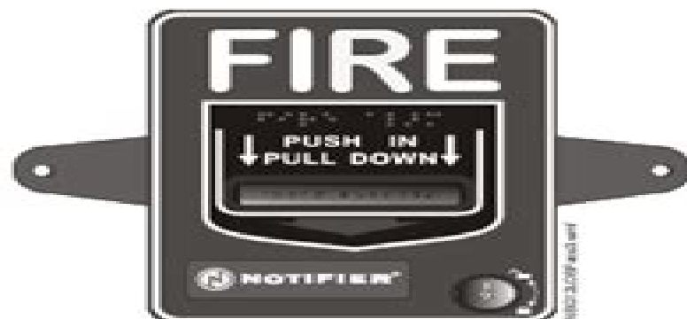
Dual Action NBG-12LOB