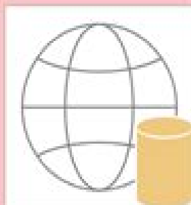
Application web personnalisée