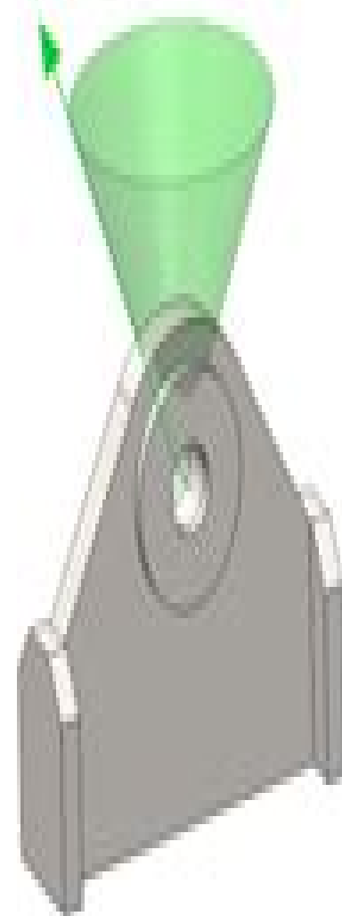
Symmetric Pad-eye (Supported)