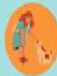
Spending Time With Pet & Animals