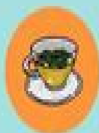
Drinking Herbal Tea