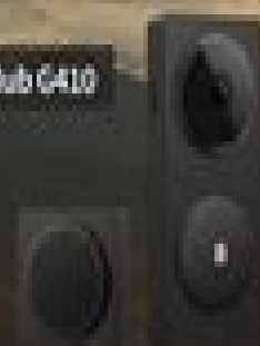
Presence Sensor FP300