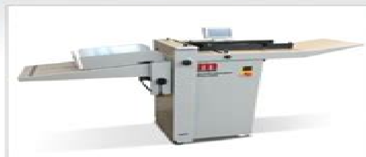
Document Creasing Machine