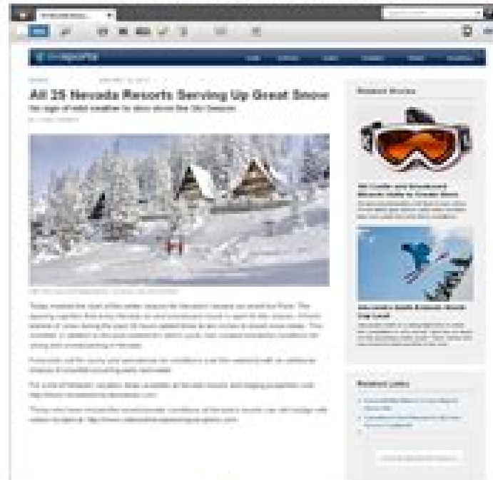
Web Mode: Web page view of a content entry form

Content entered into the content entry form (in Form Mode or Web Mode) is stored as a record in the CM system database.