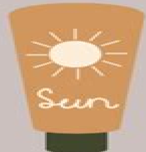
go out for fresh air