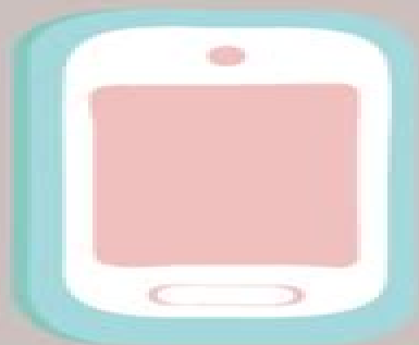
go screen free for 30 minutes