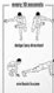
Push-up Sit-up Plank