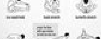
Side plank Side lunge Side squat