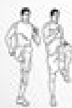
Lunge Squat Deadlift

For survival, you need to be able to run, jump, and fight. This is the only way to survive. This is the only way to survive. This is the only way to survive.