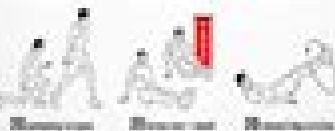
Push-up Sit-up Plank