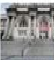
The Metropolitan Museum 4.8 (33,374) MetLife has 40 collections