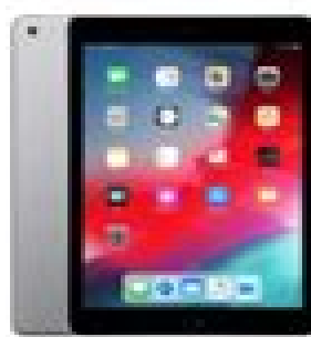
Apple iPad 5