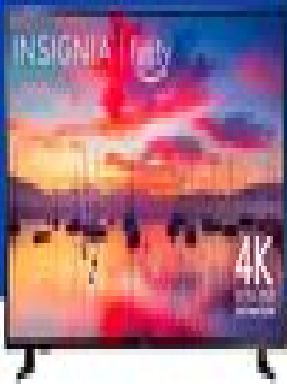
Insignia 67" class LED 4K UHD smart Fire TV

My Best Buy Plus and My Best Buy Total members get Early Access on Dec. 5.