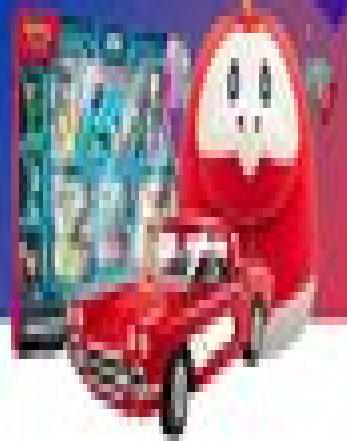
Funko Pop! and collectibles