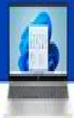
HP 15.6" touchscreen laptop